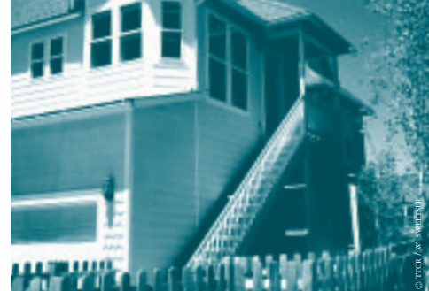
ACCESSORY APARTMENTS LIKE THIS WILL NOW BE ALLOWED IN HUNTINGTON.

“Accessory apartments are a great way to help support the aging population by providing more housing options”, he commented.