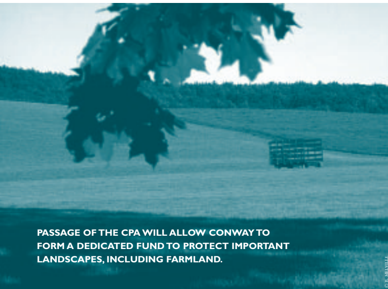
PASSAGE OF THE CPA WILL ALLOW CONWAY TO FORM A DEDICATED FUND TO PROTECT IMPORTANT LANDSCAPES, INCLUDING FARMLAND.