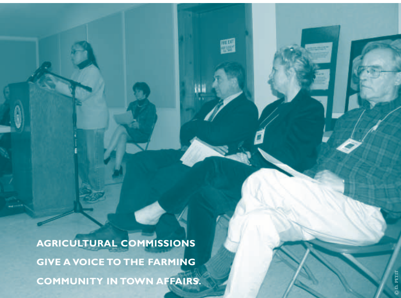
AGRICULTURAL COMMISSIONS GIVE A VOICE TO THE FARMING COMMUNITY IN TOWN AFFAIRS.